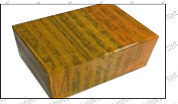
Pic No. 3 International express packaging: Wrapped with yellow tape after wrapping

Mob/Whatsapp: +86 13410541523 Tel: +8675523215133 Email: ruby@shumatt.comWebsite: www.shumatt.com