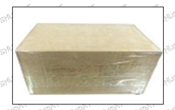
Pic No. 2 Domestic express packaging: Wrapped by Transparent tape black protective film

A Minors are prohibited from using transparent tape, yellow tape, black wrapping protective film, and white wrapping protective film to avoid personal injury. 2000